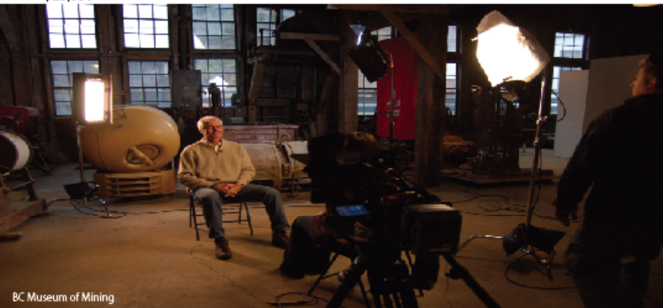
BC Museum of Mining